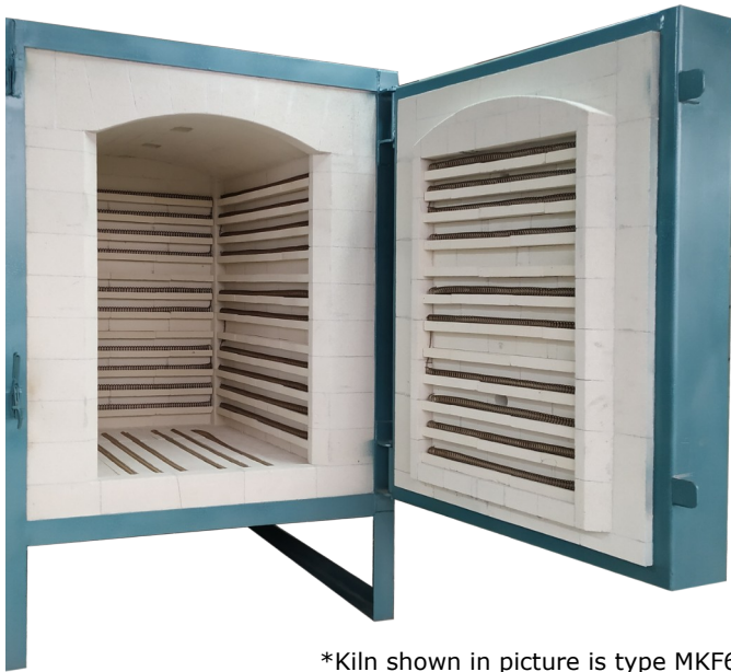
*Kiln shown in picture is type MKF600