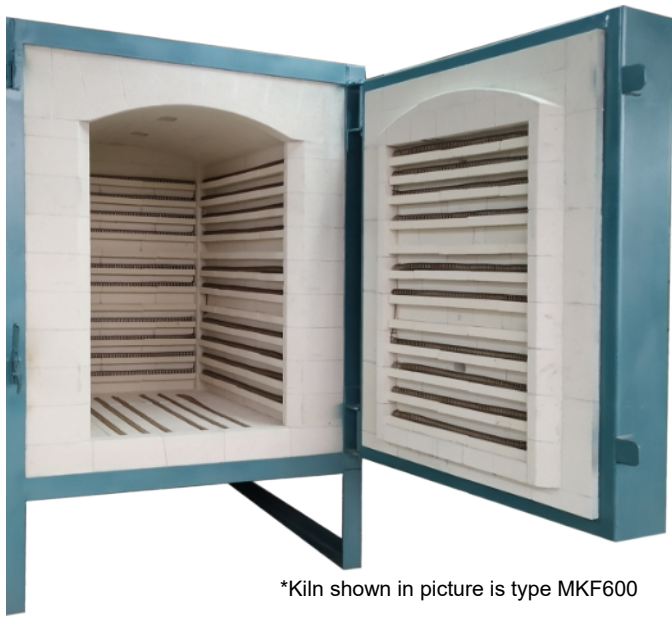
*Kiln shown in picture is type MKF600