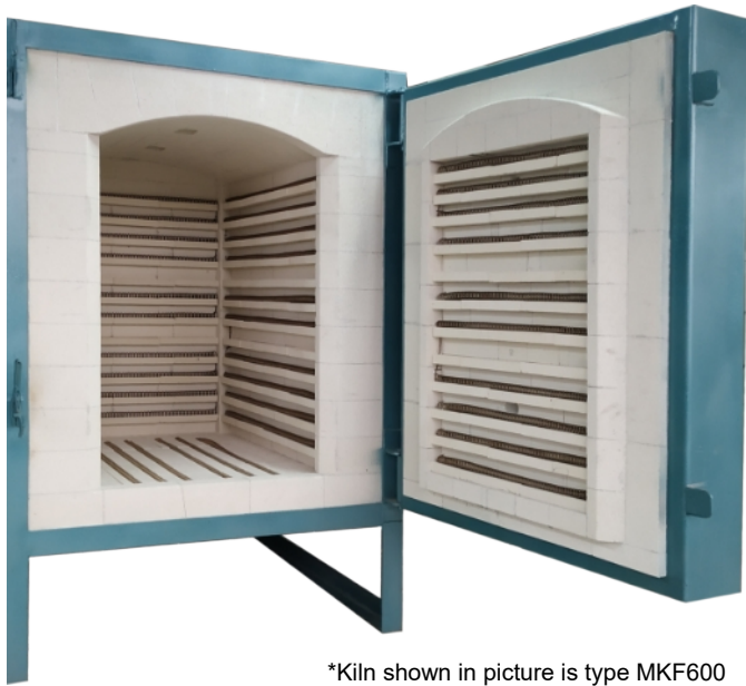
*Kiln shown in picture is type MKF600