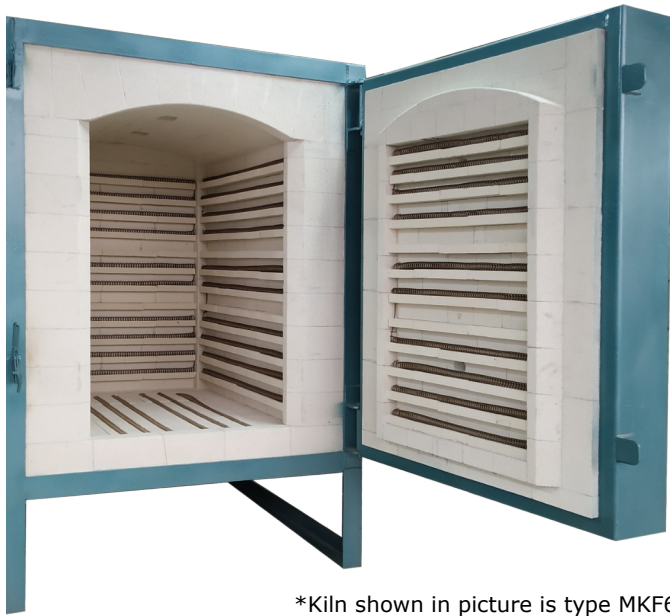
*Kiln shown in picture is type MKF600