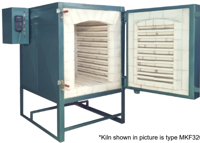
*Kiln shown in picture is type MKF320