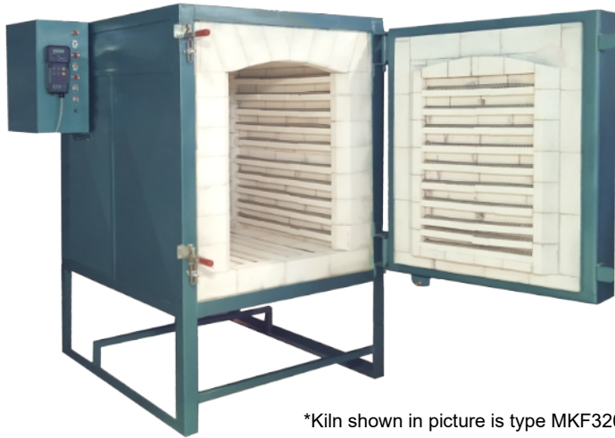
*Kiln shown in picture is type MKF320